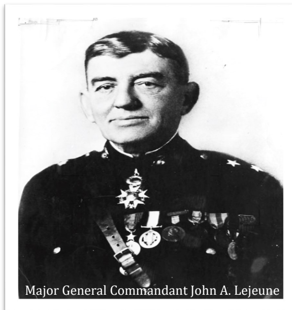
Major General Commandant John A. Lejeune

John A. Lejeune, Major General Commandant